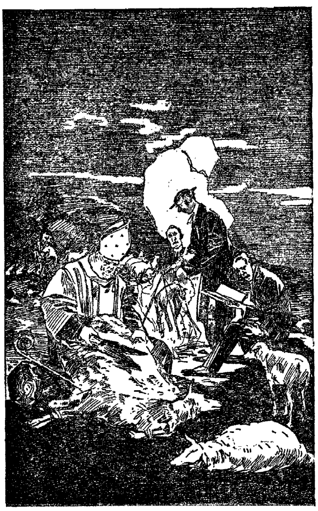
YE EAT AND CLOTHE YOU WITH THE WOOL Page 224