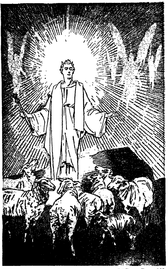
THEY ALL SHALL HAVE ONE SHEPHERD