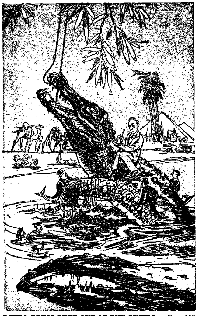
I WILL BRING THEE OUT OF THY RIVERS