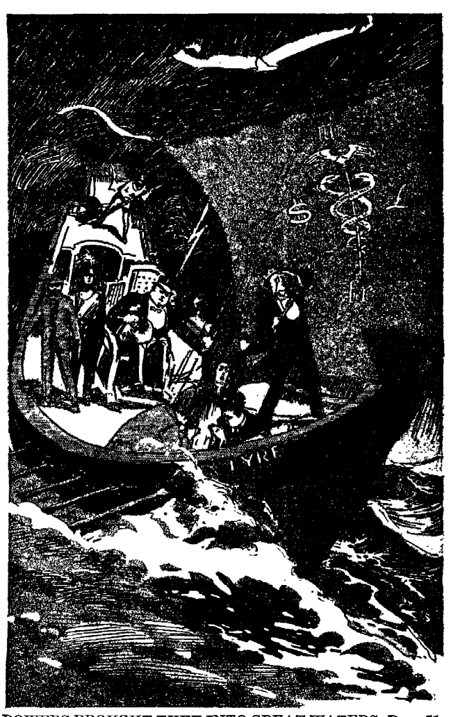
ROWERS BROUGHT THEE INTO GREAT WATERS Page 71