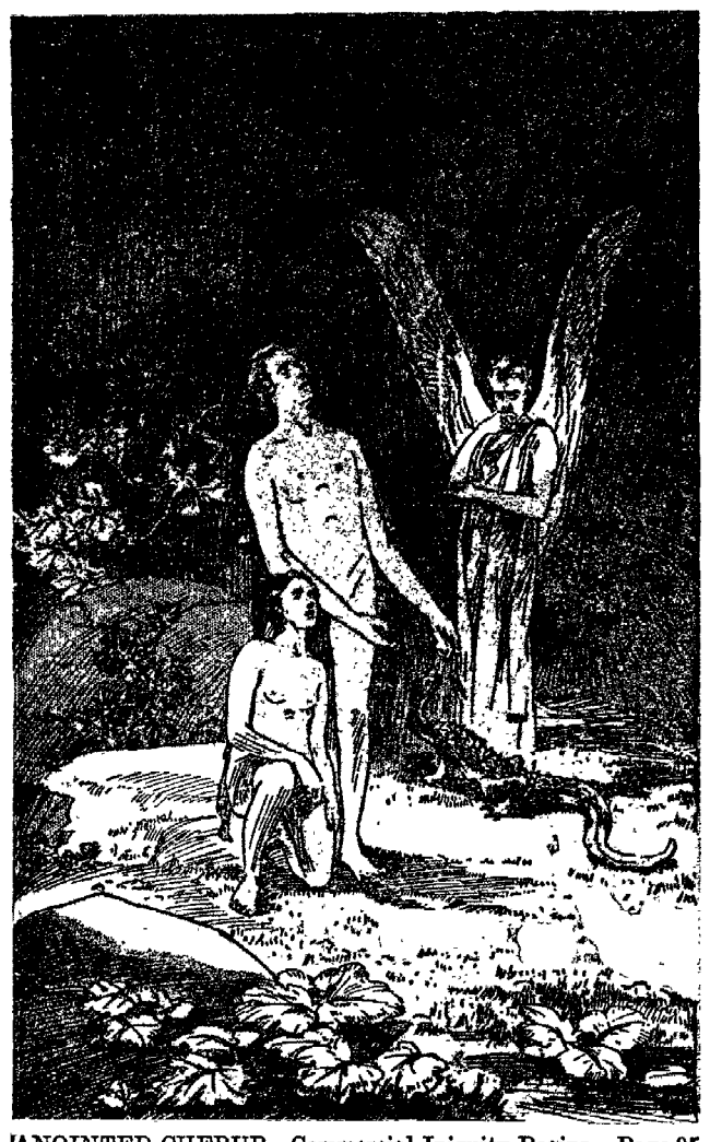
ANOINTED CHERUB—Commercial Iniquity Begins Page 95