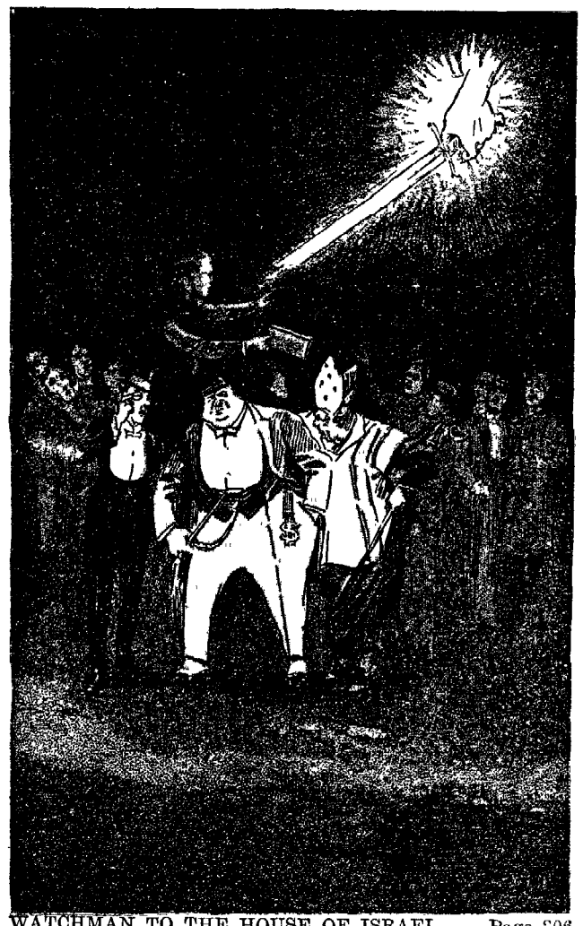
WATCHMAN TO THE HOUSE OF ISRAEL