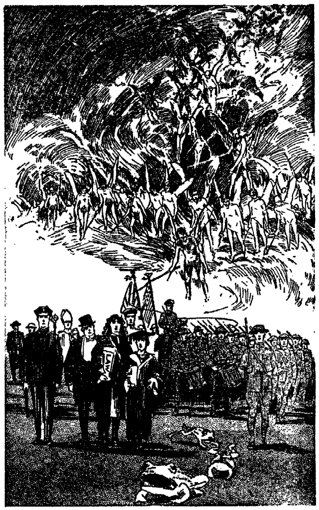
GOG OF THE LAND OF MAGOG